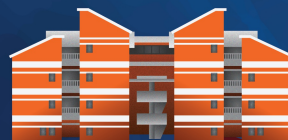
DAVAO MEDICAL CENTER