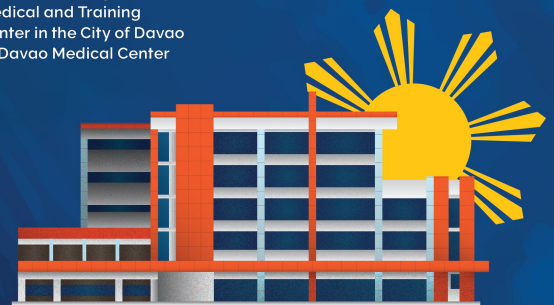
SOUTHERN PHILIPPINES MEDICAL CENTER